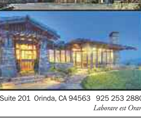
$4,995,000 ORINDA 4/4.2. Rare opportunity to buy newer estate plus two adjacent lots. Gated, wine cellar, gorgeous grounds w/pool & more!